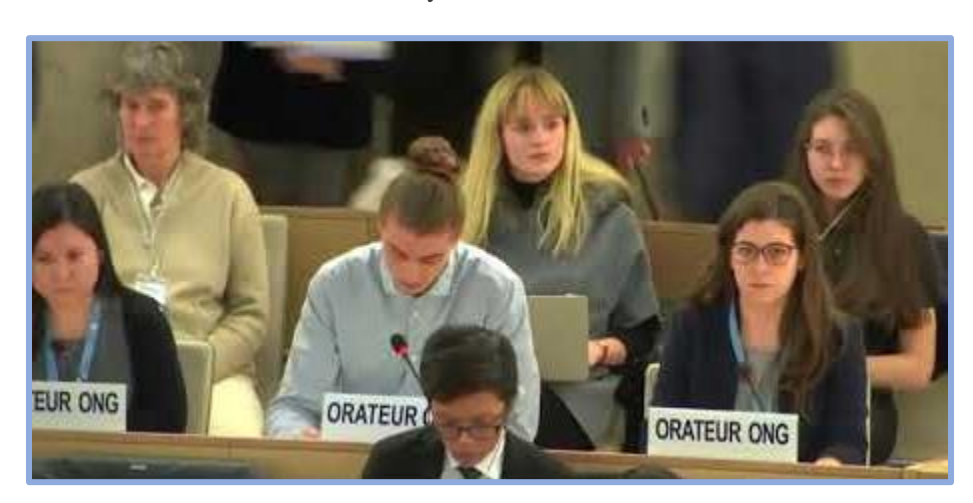
ITEM 2 – Interactive dialogue on High Commissioner report on the situation of human rights of Rohingya Muslims and other minorities in Myanmar (res. 39/2)

It became apparent over the past decades that Israel ignores recommendations by the international community. Thus, we call upon the UN to apply more firmly stricter measures that protect the people of Palestine from violence carried out by Israel. Furthermore, we reiterate the need for a lasting solution for peace with justice.