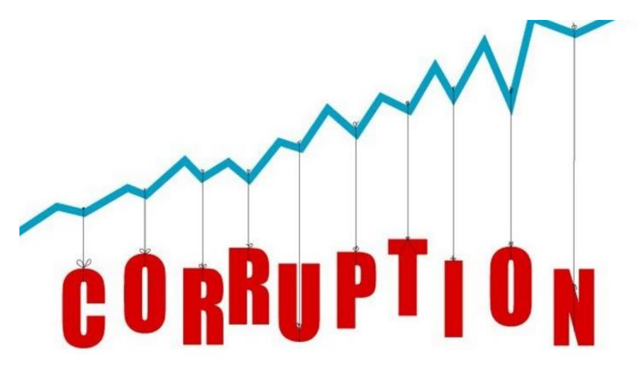
Link to full written statement

We are noticing with deep concern a global rise in corruption in all regions and all nations. With this rise, we should not ignore an alarming fact: development is not an immunization against corruption. Many developed countries will be the first to denounce corrupt governments in other regions of the world, conveniently ignoring the issues that they themselves face. Corruption is intimately linked with the overall health of democratic institutions. The countries that are most efficient at tackling corruption are, unsurprisingly, those whose democratic institutions are most protected and independent. Yet we notice the degradation of such institutions even in many countries that have taken a leading role in the promotion of human rights. If this trend continues, it will compromise every effort at making this world a safer place.