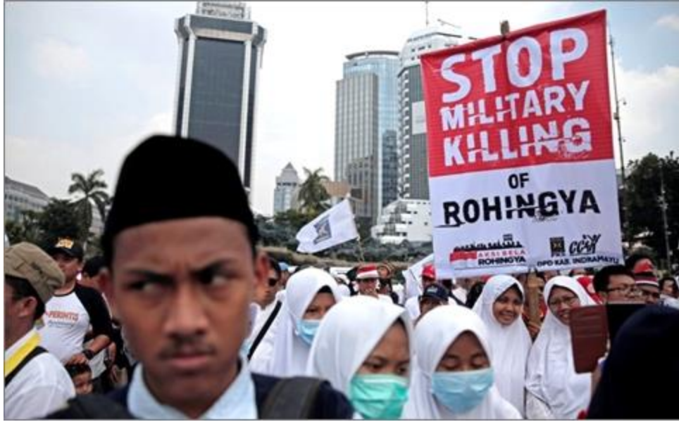
A protest against the treatment of the Rohingya Muslim minority by the Myanmar government, in Jakarta, Indonesia