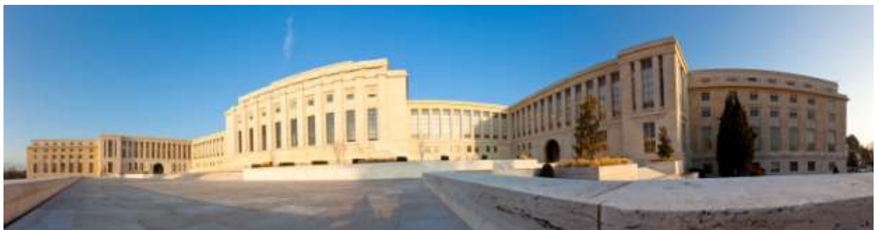
Palais des Nations | Kris à Genève