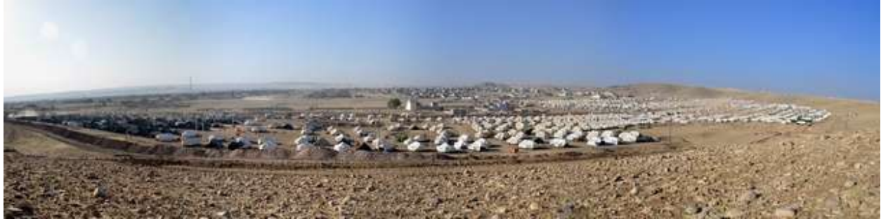
Syrian Refugees Camp | Guardian Witness